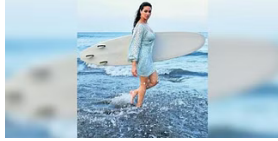
Wear but waste not: Virgio's new collection a perfect balance between style and sustainability