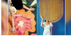
Roving rugs: Carpets in new Studio by Agni collection inspired by nomadic wanderlust