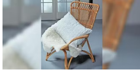
A nod to Nordic grace: Norse Brands brings the best of Scandinavian comfort and elegance