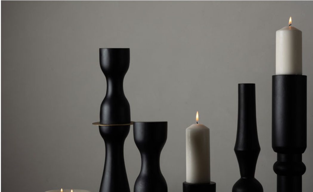
Nura Totems Collection by Escape by Creatomy

Related Tags: Valentine's Day 14th February V Day V Day Gifting