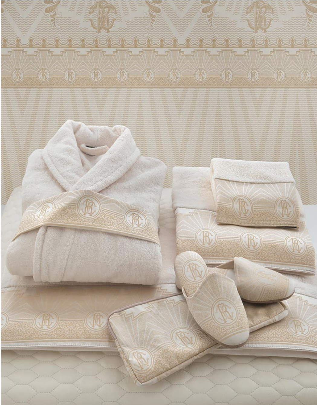
Roberto Cavalli available at Maison by Nirmals.