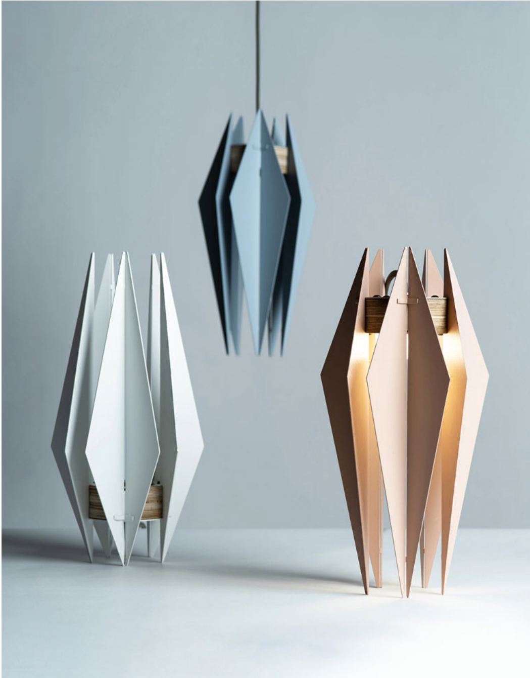
Hikari Lamp Collection available at SPIN.