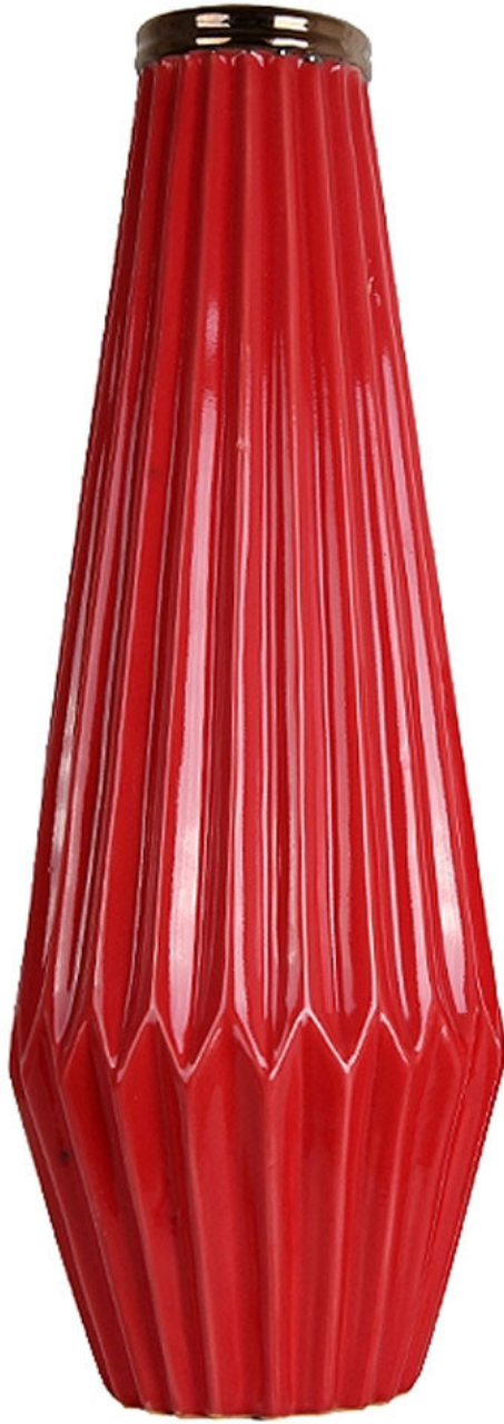
Red Colour Vase available at Dash Square.