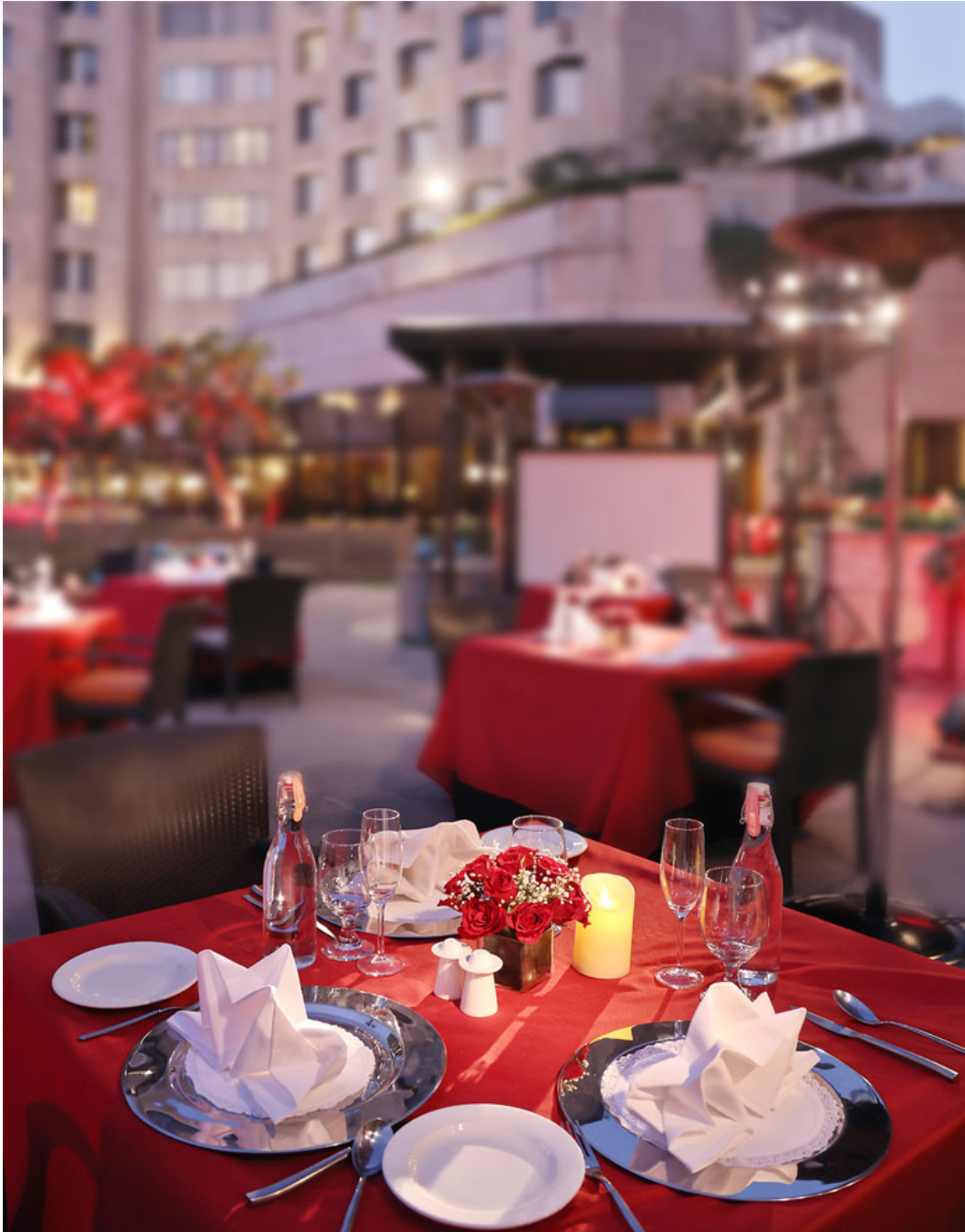
Celebrate Valentine's Day at the Poolside, ITC Maurya, New Delhi.