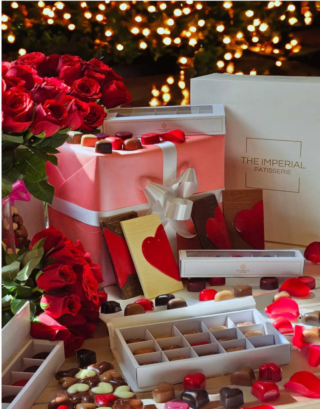
Bespoke heart chocolate bars and chocolates at The Imperial Patisserie.

an Imperial Spa Valentine's wellness retreat for a holistic renewal experience. Make this Valentine's Day truly special at The Imperial.