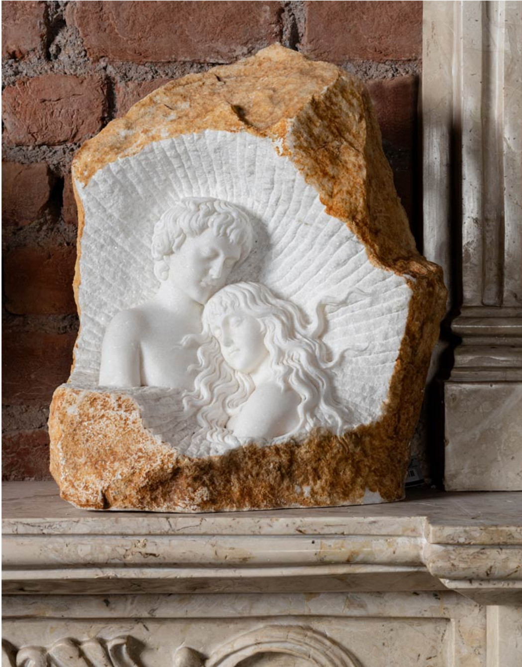
Stone Art's "Rock Statues Collection."