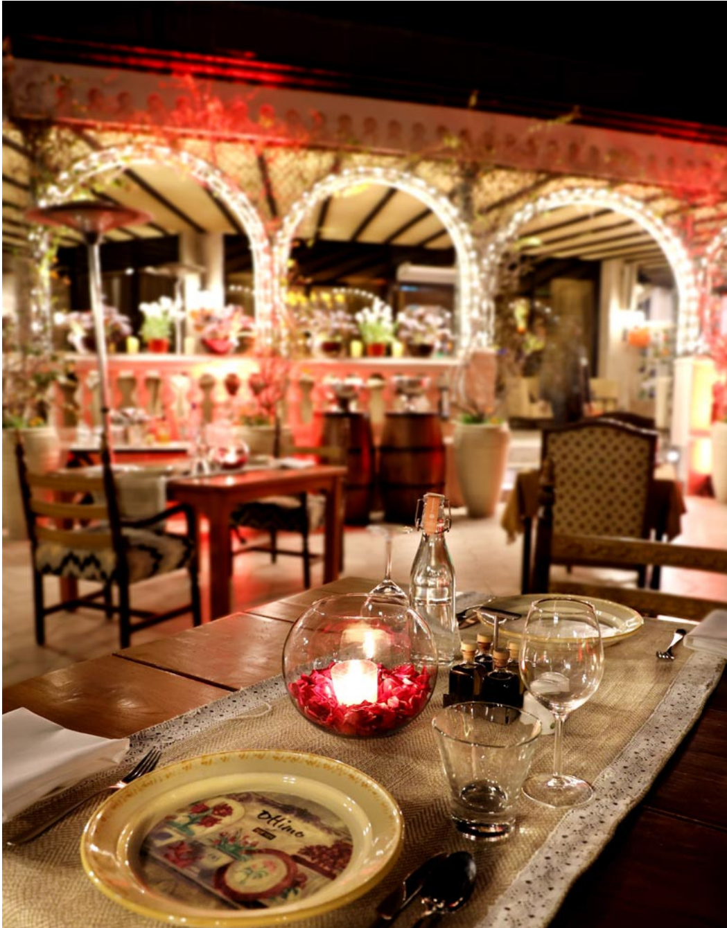
Dine in at Ottimo, ITC Maurya, New Delhi.