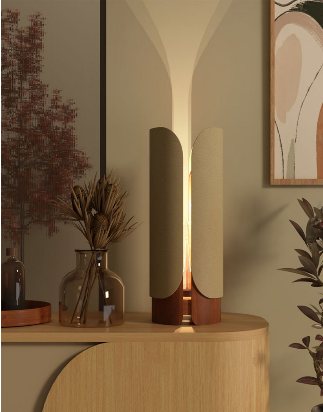
Jacobs Lamp collection available at Mohh.