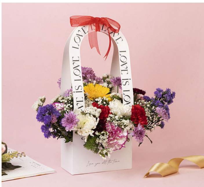
Colourful love bouquet with sleeves available at The Gift Studio.

The Gift Studio's Floral Bliss brings vibrant, fragrant flowers like a burst of sunshine, echoing the joy of love. The Dazzling Diva Box and Romantic Ritual Gift Box weave intimate moments, transcending the ordinary.