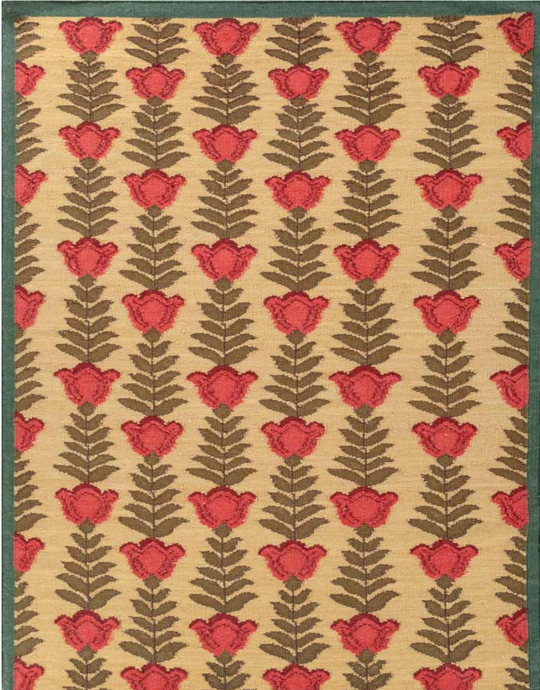
The Aprezo Collection by Jaipur Rugs