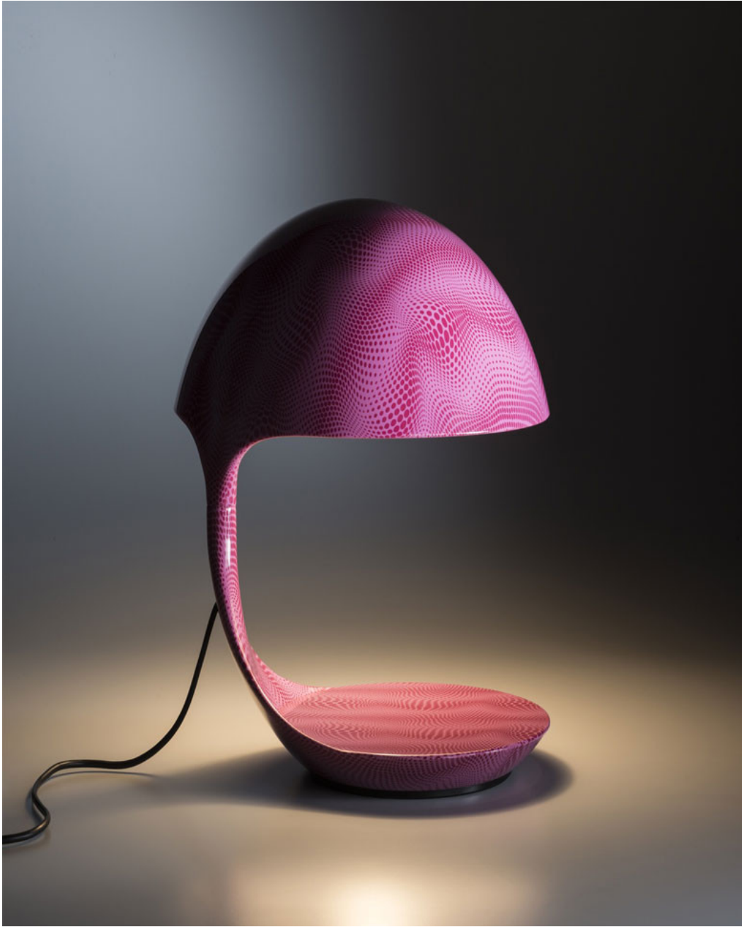
Martinelli Luce lamp available at Innovative Design Studio by Innovative Design Group.