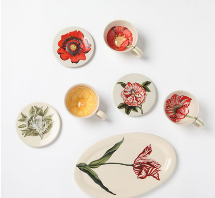
vVyom By Shuchita's hand-painted ceramics.