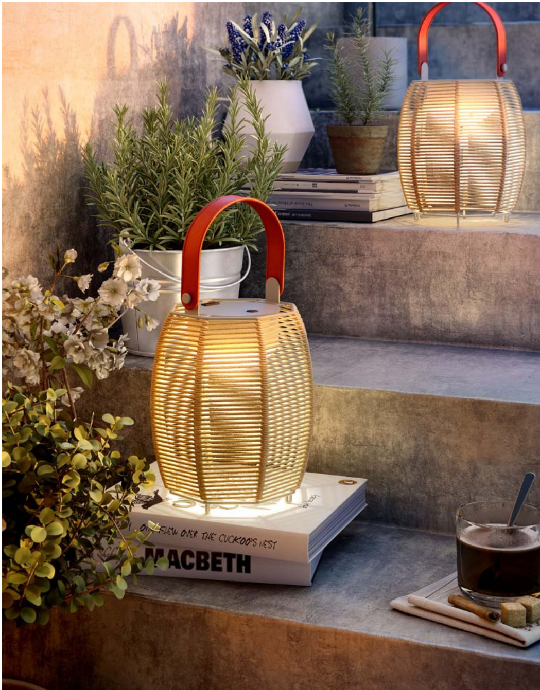
Bover lamp available at Sources Unlimited.