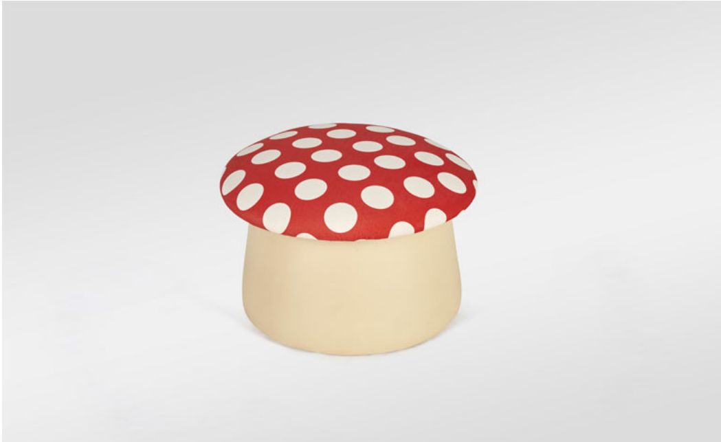
Mushroom Pouffe available at Amardeep Design.